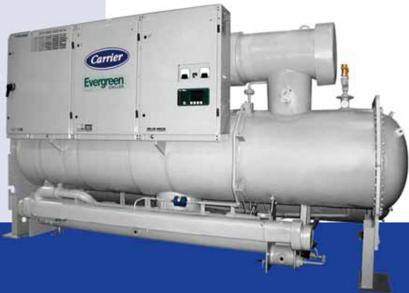
23XRV ■ HFC-134a ■ 300 to 550 tons